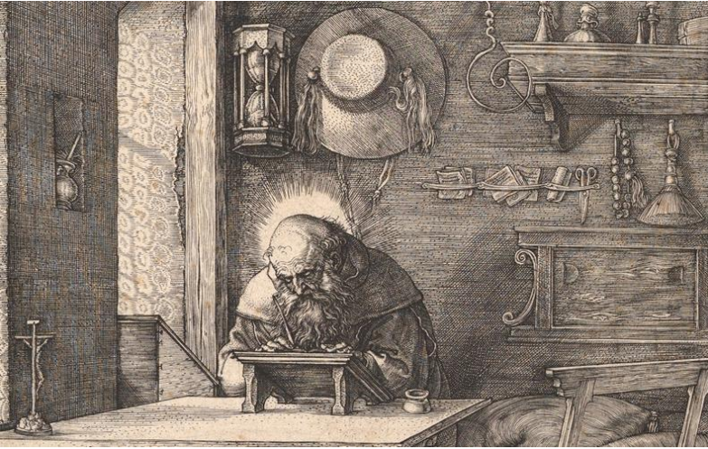
Albrecht Dürer, Saint Jerome in His Study , 1514