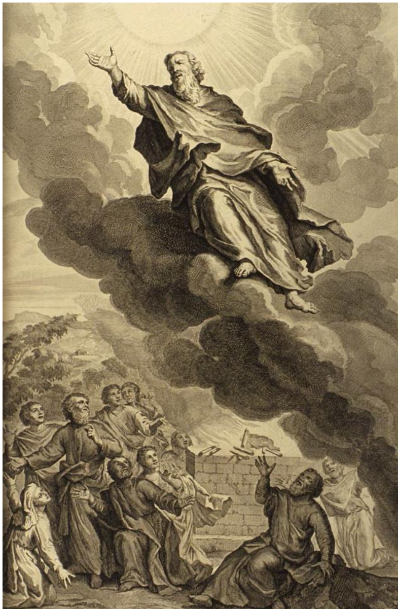
Illustration from "Figures de la Bible" (1728) by Gerard Hoet, which depicts Enoch ascending into heaven.