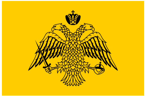
Flag used to represent the Greek Orthodox Church.

Click "Dues Donations and Meal Fees" under the "Membership" tab.