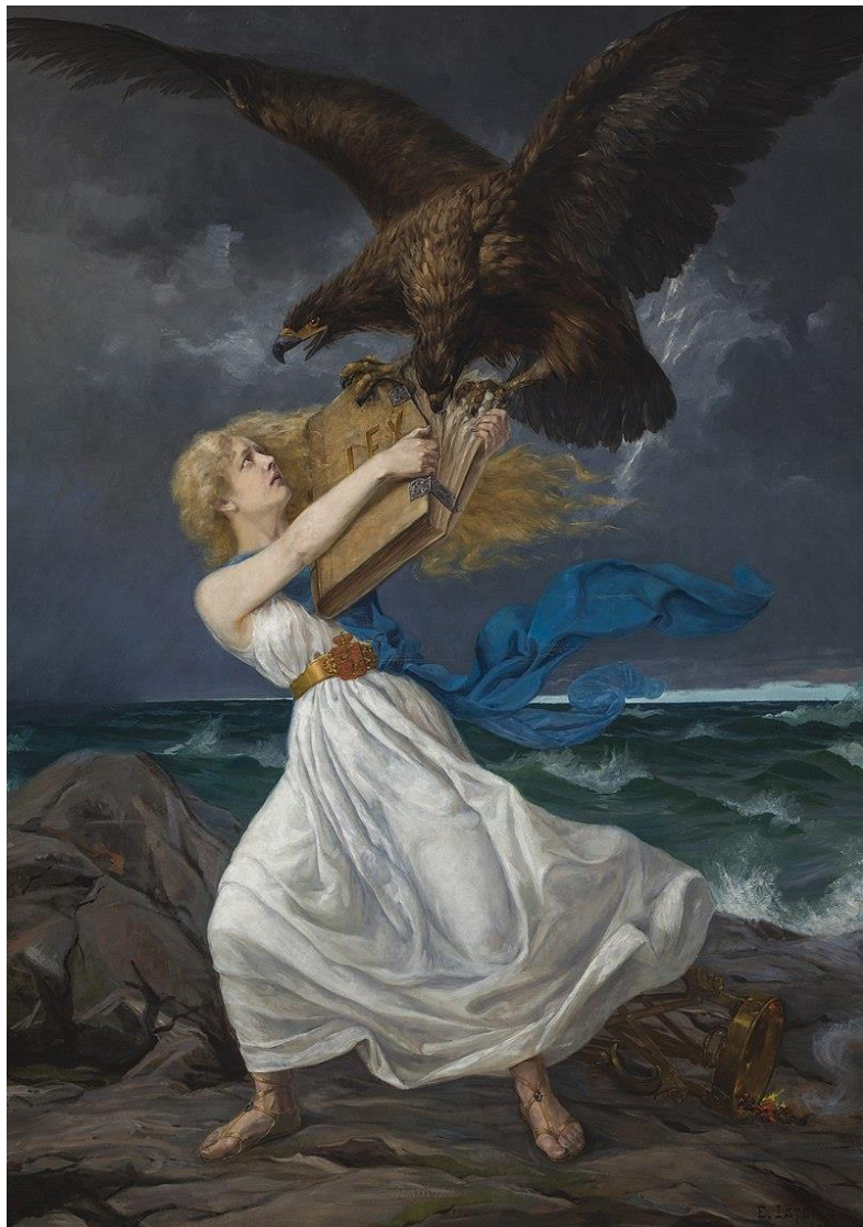
The Attack (1899) by Finnish artist Edvard Isto. The painting shows a double-headed eagle (representing the Russian Empire) taking/destroying a law book from the "Finnish Maiden" which is the national personification of Finland. This was painted as the Russian Empire was trying to destroy the national identity of Finland.

The double-headed eagle is not an invention of the Scottish Rite, nor is it an invention of Freemasonry. In fact, the symbol predates the Scottish Rite, Freemasonry, England, and even the English language. The symbol may have its origins in the lost annals of history, but some of the earliest known examples of it being used are from the Bronze Age in Mesopotamia, Anatolia (modern day Turkey), and ancient Greece.