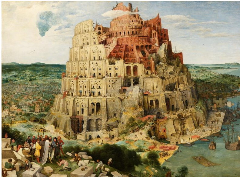
The (Great) Tower of Babel (c. 1563) by Pieter Bruegel the Elder. The Tower of Babel from the Book of Genesis remains an ancient example of the arrogance of man. God scattered the people around the Earth and created different languages so that they could not complete the tower.