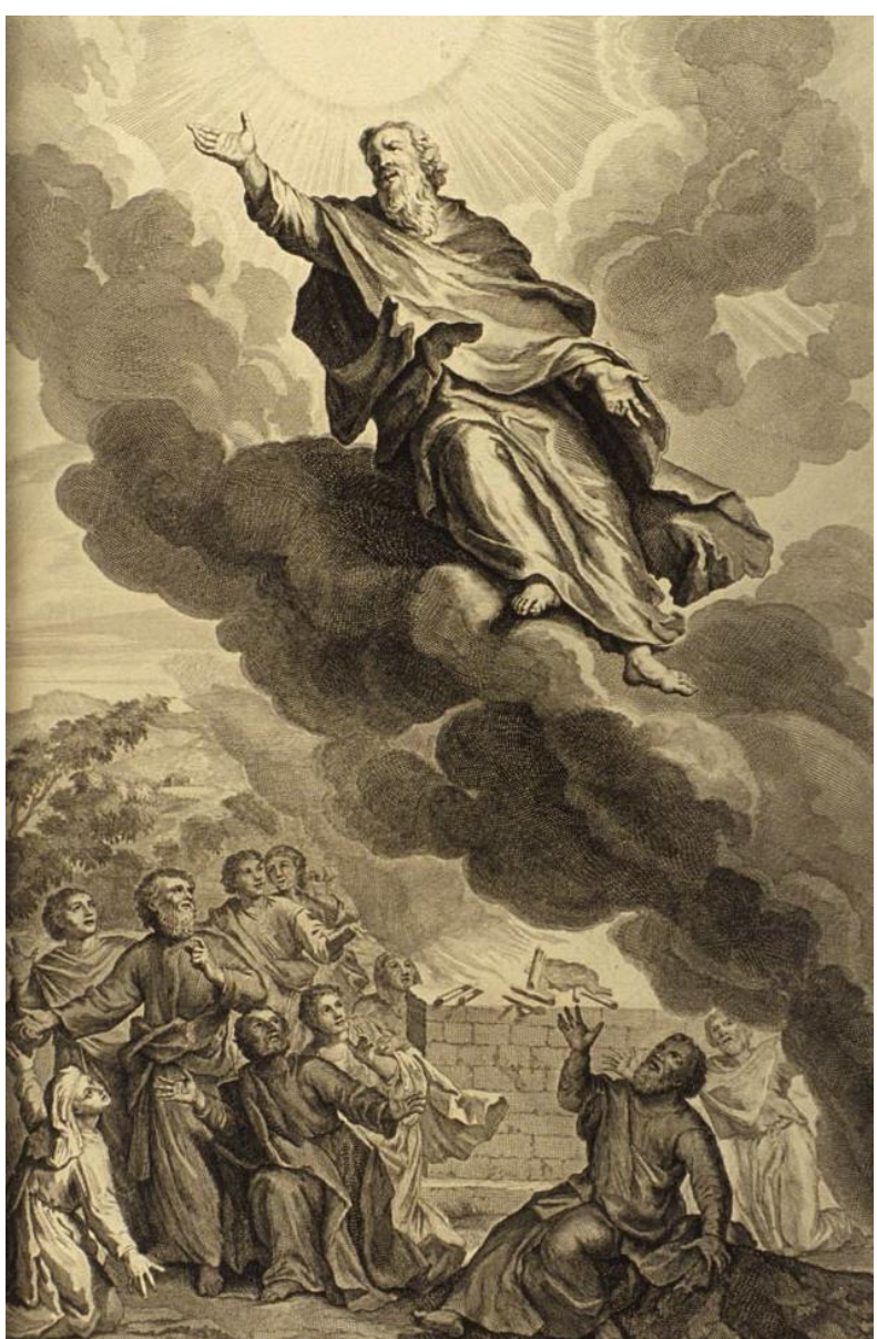
Illustration from "Figures de la Bible" (1728) by Gerard Hoet, which depicts Enoch ascending into heaven.

A MONTHLY PUBLICATION DECEMBER 15, 2022 VOLUME 1 ISSUE 10