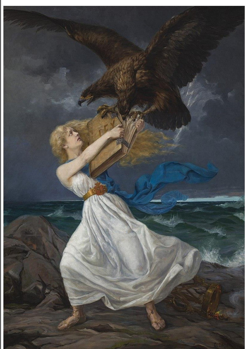
The Attack (1899) by Finnish artist Edvard Isto. The painting shows a double-headed eagle (representing the Russian Empire) taking/destroying a law book from the "Finnish Maiden" which is the national personification of Finland. This was painted as the Russian Empire was trying to destroy the national identity of Finland.

The double-headed eagle is not an invention of the Scottish Rite, nor is it an invention of Freemasonry. In fact, the symbol predates the Scottish Rite, Freemasonry, England, and even the English language. The symbol may have its origins in the lost annals of history, but some of the earliest known examples of it being used are from the Bronze Age in Mesopotamia, Anatolia (modern day Turkey), and ancient Greece.